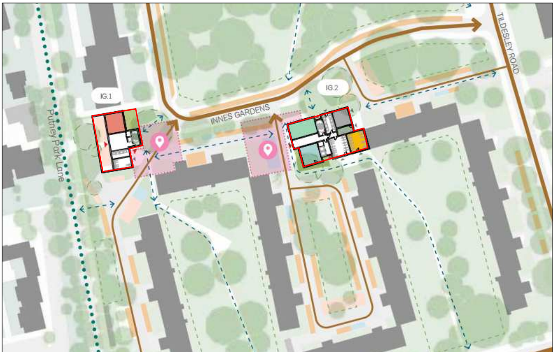
Figure 2.2 Proposed infill site locations