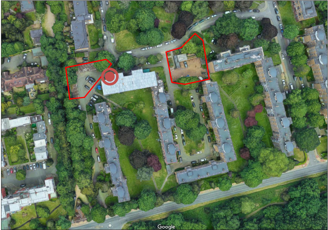
Figure 2.1 Site measurement position