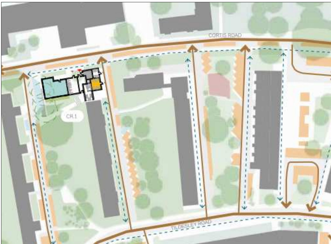
Figure 2.2 Site location