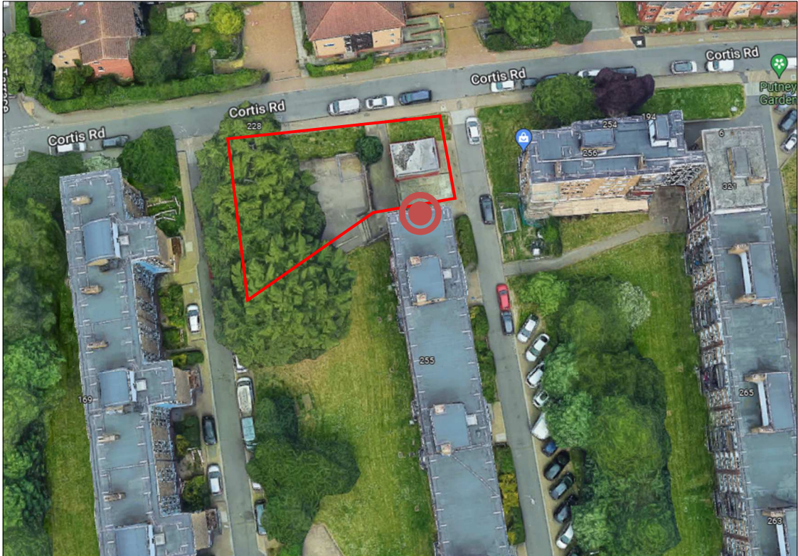
Figure 2.1 Site measurement position